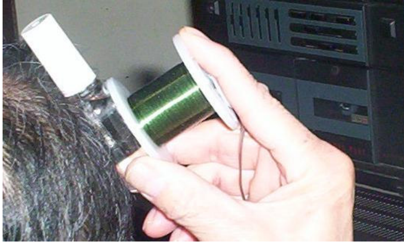
Figure1. Photograph of a typical setup for the first set of experiments with a magnetic coil.