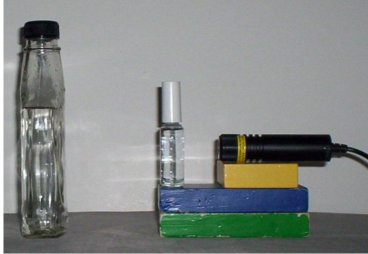
Figure3. Photograph of a typical setup for the second set of experiments with a 50mW red laser device.