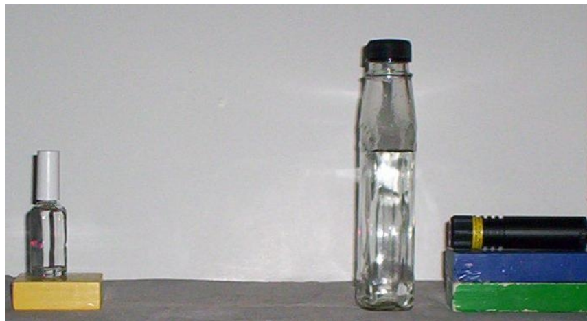
Figure 4. Photograph of a setup for the entanglement verification experiments.