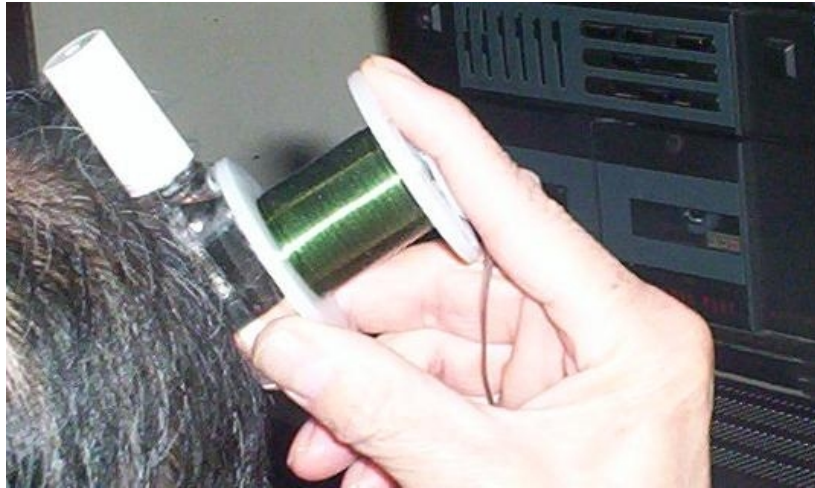
Figure 1. Photograph of a typical setup for the first set of experiments with a magnetic coil.