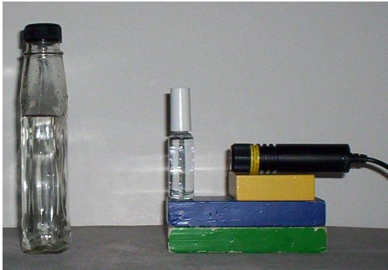
Figure 3. Photograph of a typical setup for the second set of experiments with a 50mW red laser device.