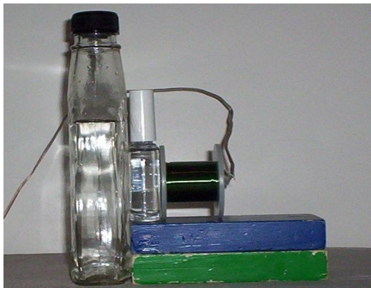
Figure 2. Photograph of a typical setup for the second set of experiments with a magnetic coil.